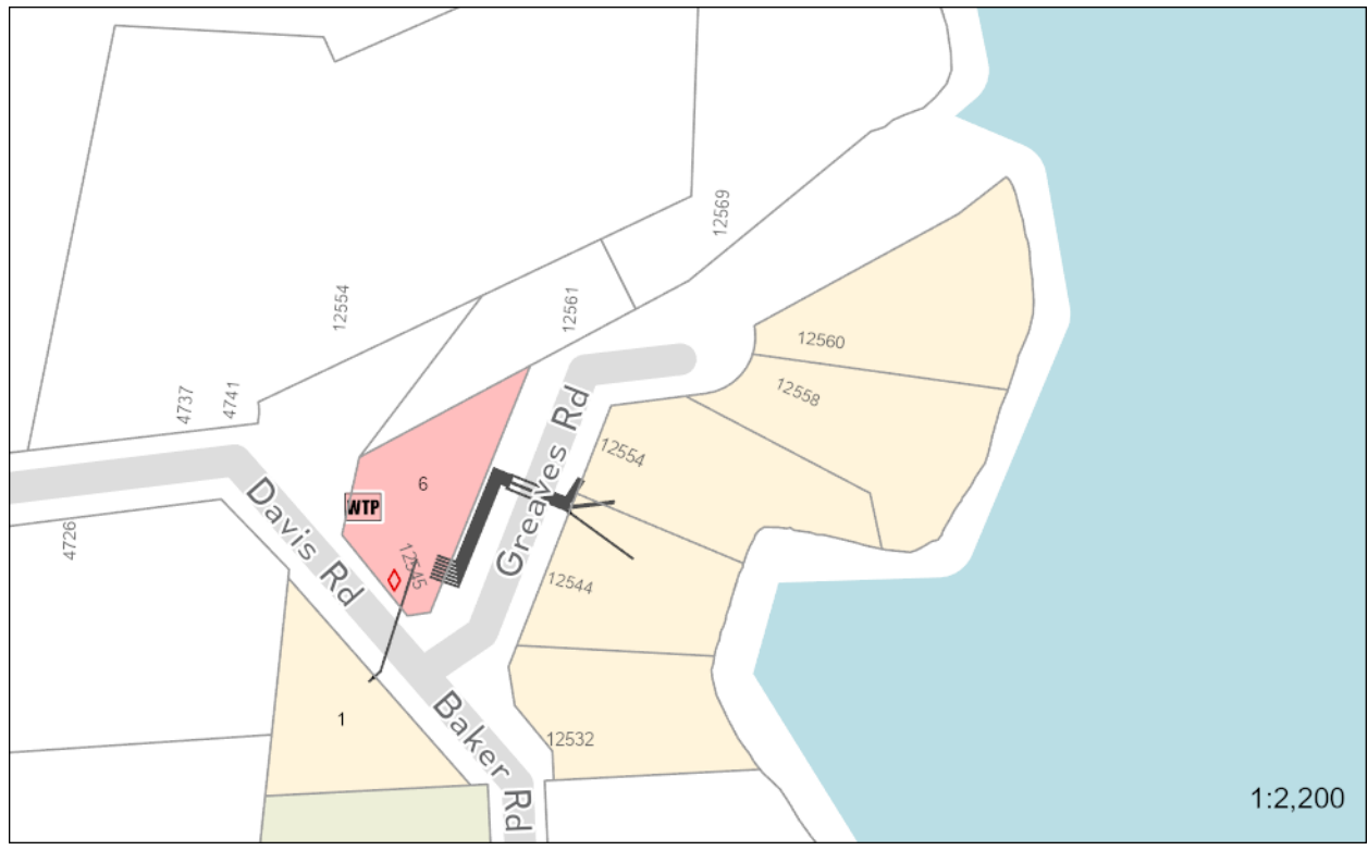
Figure 1 – Map of Wastewater Local Service Area and Infrastructure