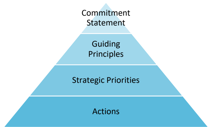
Figure 2: Water Strategy Framework

Within each Strategic Priority, actions describe how the SCRD will achieve the Water Strategy.