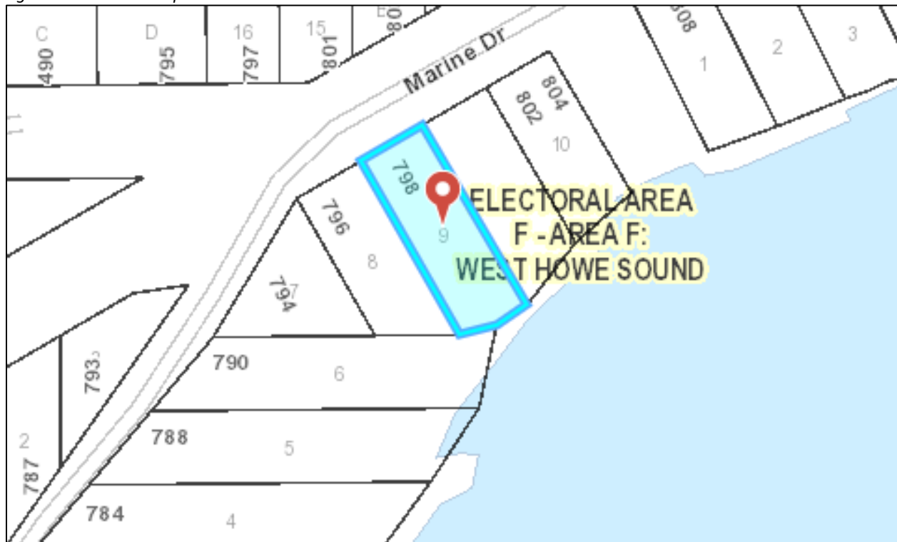
Figure 1 - Location Map