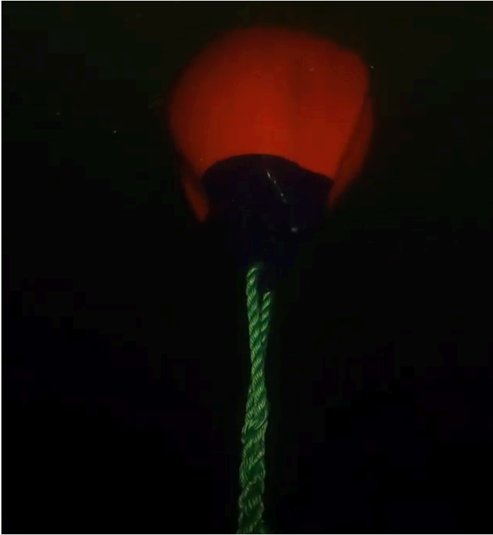
Photo 6: A3 Scotchman mid water float suspending intake screen off the lake bottom.