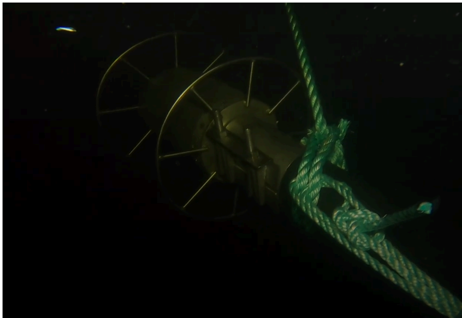
Photo 5 New intake screen suspended approximately 15' from the lake bottom