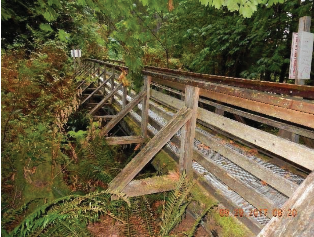
P15 – East side of the bridge (DSCN9866.jpg)