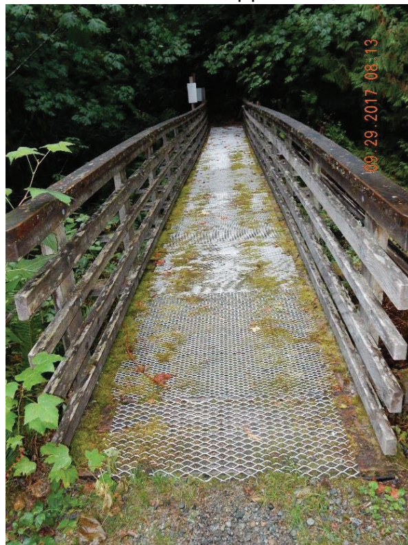
P02 – Overall decking (DSCN9846.jpg)