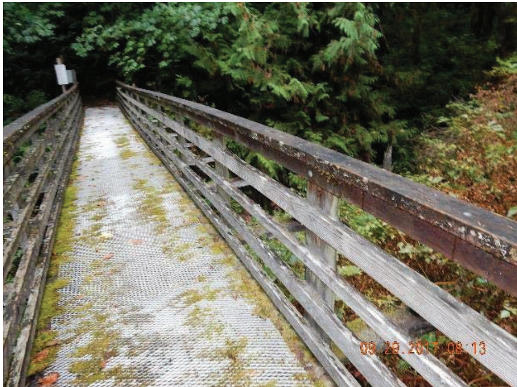
P04 - East railing (DSCN9848.jpg)