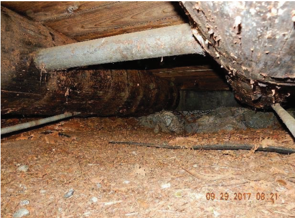
P16 – North abutment (DSCN9867.jpg)