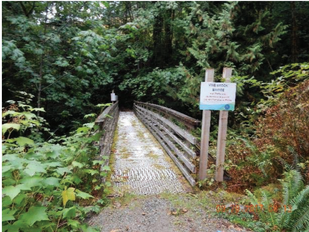
P01 – South approach (DSCN9844.jpg)