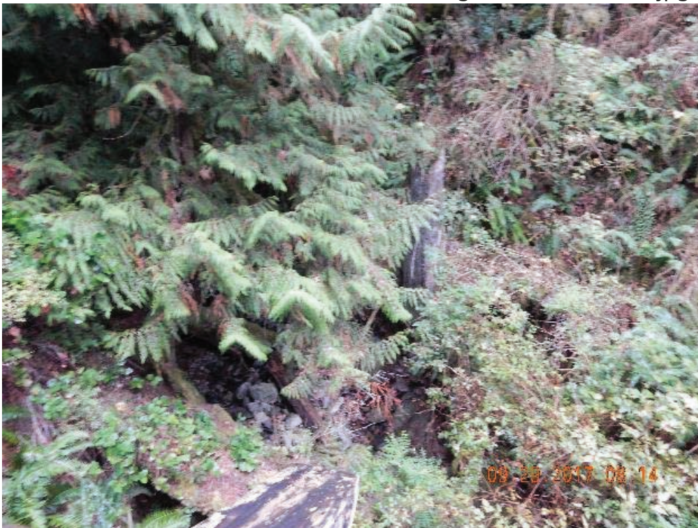
P06 – Upstream (looking east) (DSCN9851.jpg)