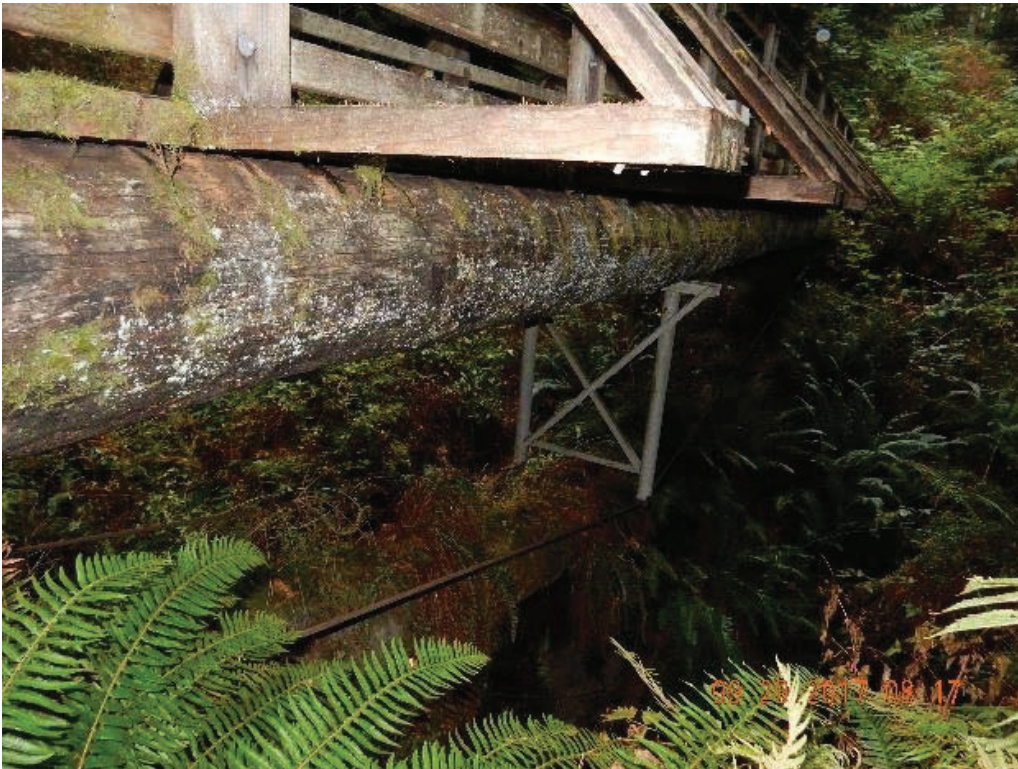
P12 – West side of the bridge (looking at middle pier) (DSCN9860.jpg)