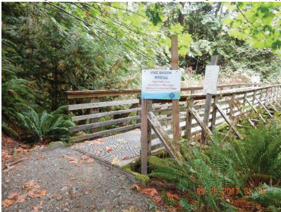
P08 – North approach (DSCN9854.jpg)