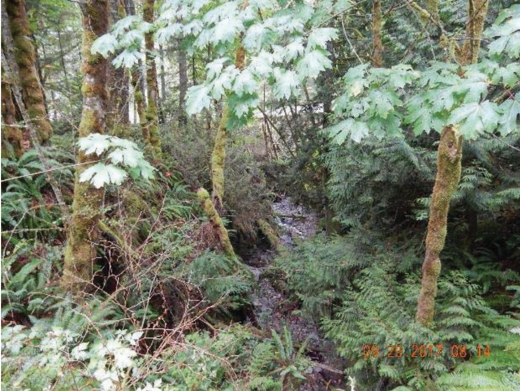
P05 – Downstream (looking west) (DSCN9850.jpg)