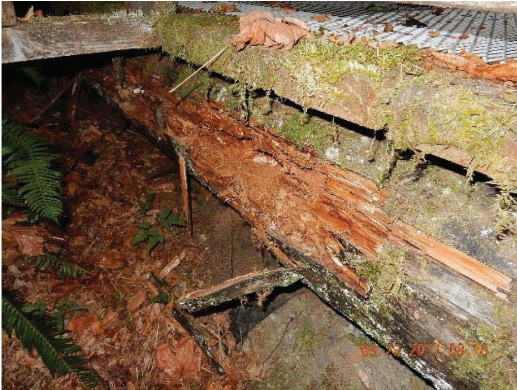
P11 – Northwest corner of the bridge, log is breaking apart (DSCN9859.jpg)