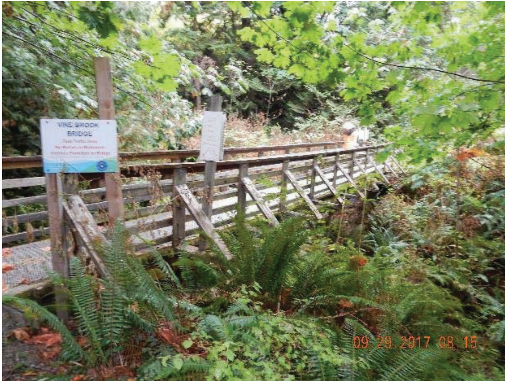
P09 – West side of the bridge (DSCN9855.jpg)