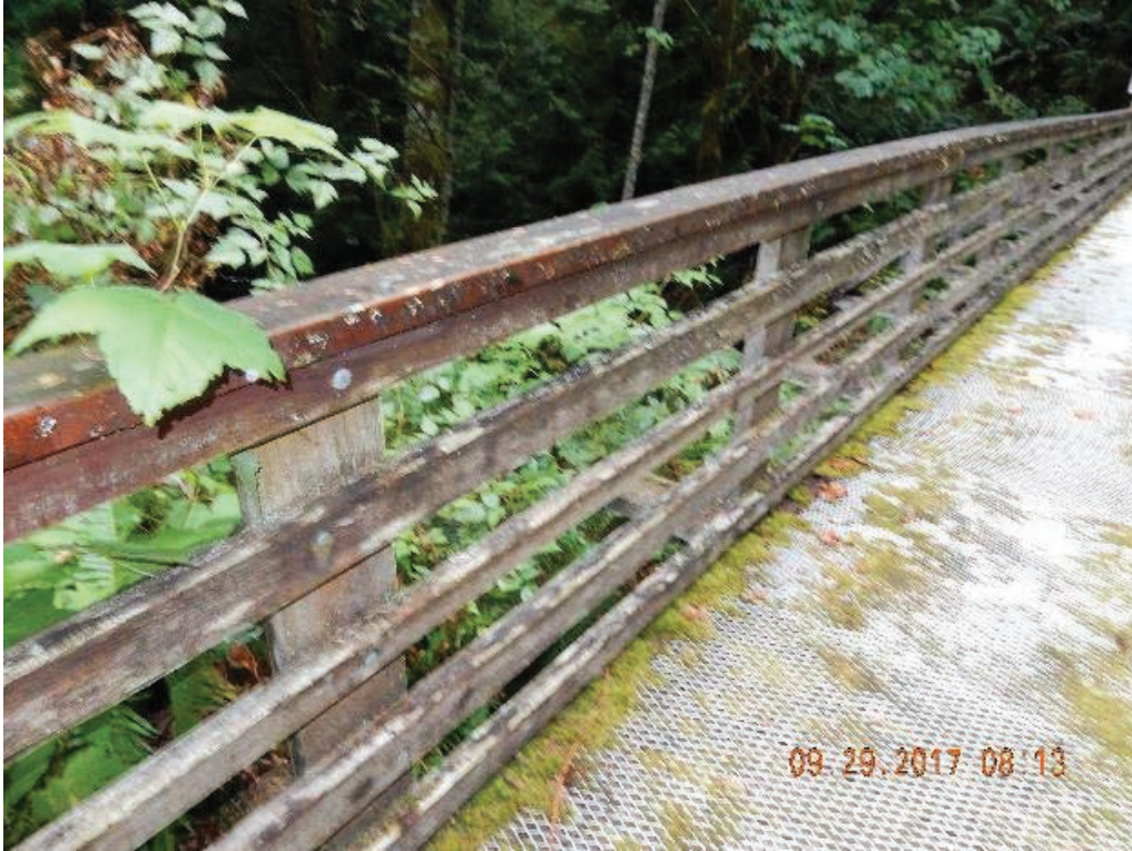
P03 - West railing (DSCN9847.jpg)