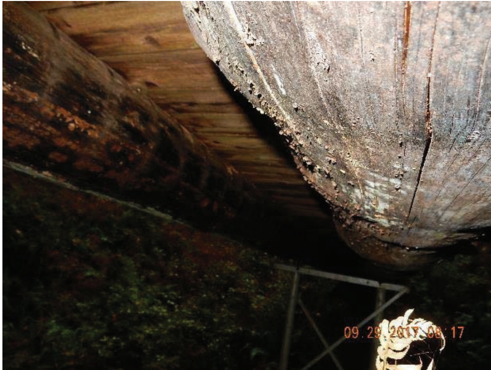
P13 – Under side of the bridge (DSCN9863.jpg)