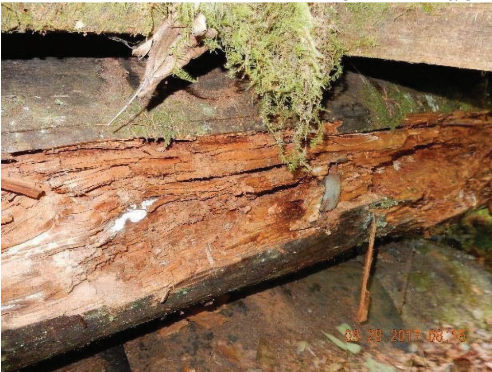
P10 – Northwest corner of the bridge, log is breaking apart (DSCN9856.jpg)