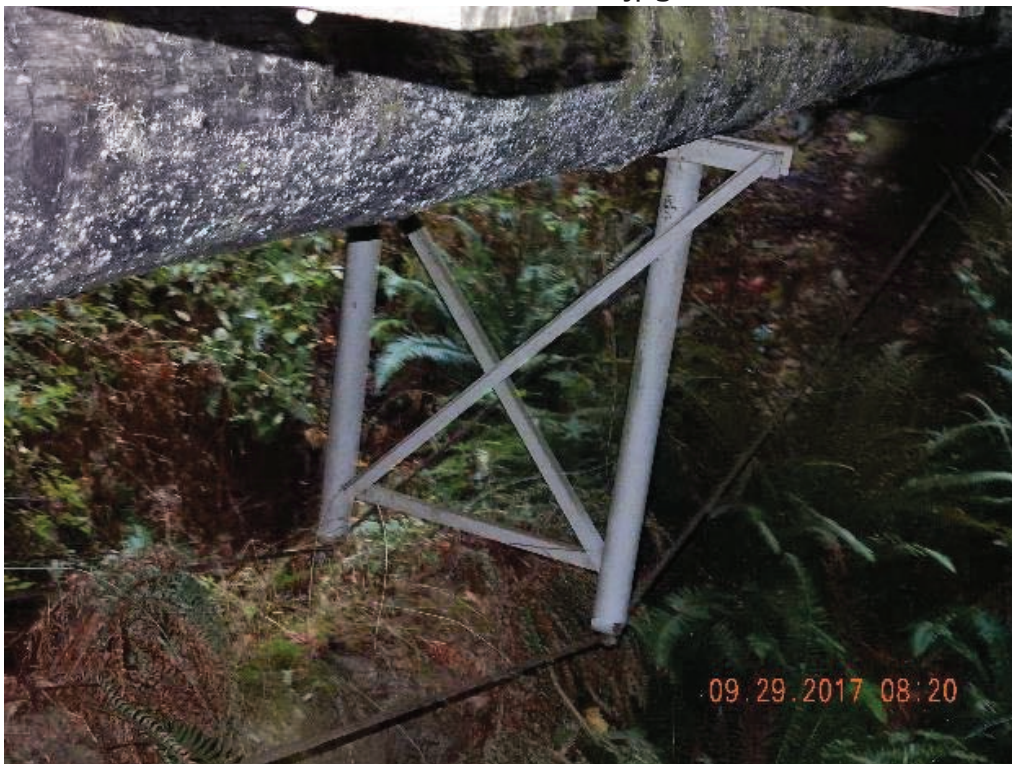
P14 – Middle pier (DSCN9864.jpg)