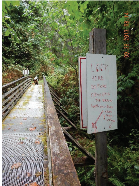
P07 – Sign at northwest corner of the bridge says, “Look here before crossing the bridge with your quad, check bridge stringer” (DSCN9853.jpg)