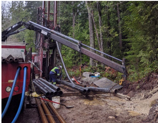
Figure 1: Well drilling in the SCRD.

The Sunshine Coast Regional District (SCRD) has initiated another phase of groundwater investigations to explore the feasibility of supplementing the Chapman Water System with a new groundwater source. This investigation focus' on the Sechelt area, with five identified sites where test wells will be drilled. If results of test wells are favourable, the next phase would be design, engineering and permitting of production wells in the chosen location(s).